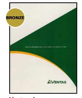
Ventas, Inc. Bronze Award Winner

Regency Centers Corporation vww.regencycenters.com Gold Award Winner